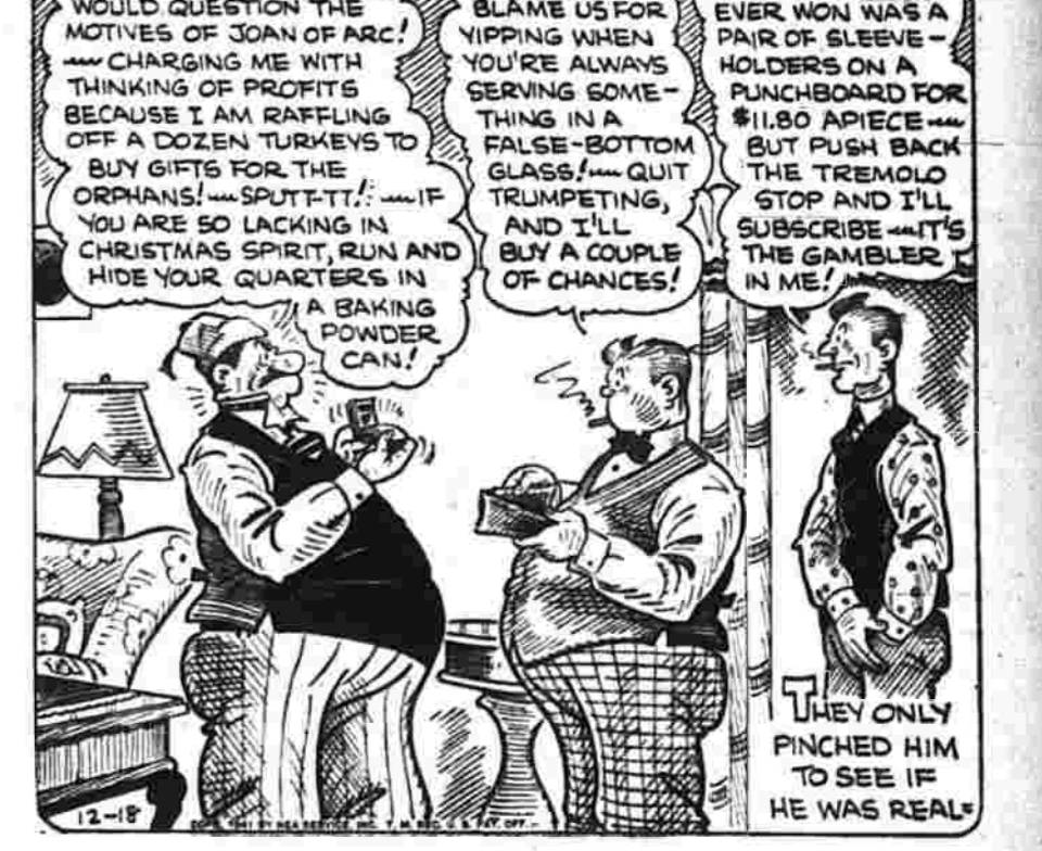
WASH TUBBS Gyped Again