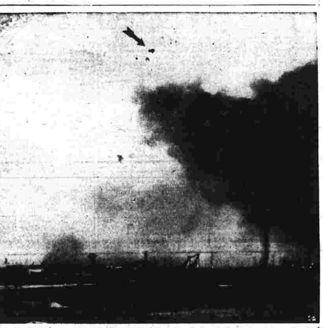
An attacking Japanese plane, (arrow) dodging through anti-aircraft bursts, moves over the U. S. Naval base at Pearl Harbor, Hawaii, during the Sunday morning attack by Japanese forces which started the war between the two nations. Smoke is from the burning U. S. battleship Arizona, which was sunk.