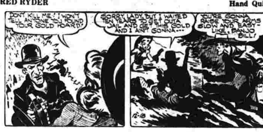
RED RYDER Hand Quicker Than Eye

Who Wants to Know? In just salutation, And common sense should bar you from lengthy explanation, Of each and every dreaery reaction and neurasthenia. It doesn't mean devoting an answer to the question, In which you're tantalizing what's wrong with your digestion? Or operations that you don't analyze and spell 'em. And when folks ask "How are you?" for heaven's sake don't tell 'em! Teacher- What is capital punishment? Pupil-Taxes. Even though we can't have all we want, we ought to be thankful we don't get all we deserve. Non-What's the matter, Dad? Dad-Repeat, my boy, is what a man thinks of on the way home. Foibles of custom? If underwear looked like beachwear you could walk down the street in it. A would-be chicken fancier had some difficulty with her flock and wrote the Department of Agriculture. "Something is wrong with my chickens. Every morning when I come out I find several young on the ground cold and stiff, their feet in the air. Can you tell me what the matter?" Soon she received the following letter from the Department: "Dear Madam. Your chickens are dead." Every morning when I come out I find several young on the ground cold and stiff, their feet in the air. Can you tell me what the matter?" Soon she received the following letter from the Department: "Dear Madam. Your chickens are dead."