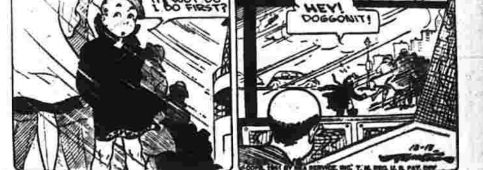
UNIVERSITY FOLKS BY FONTAINE FOX