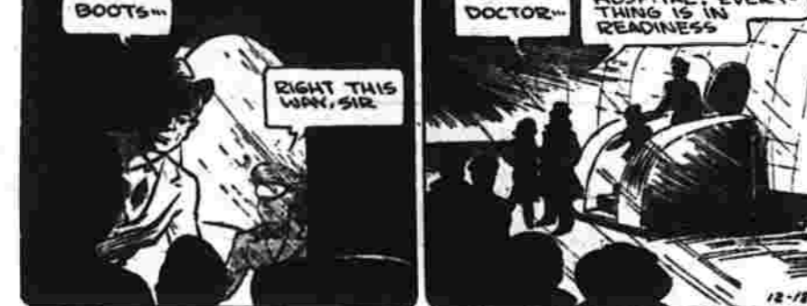
ALLEY OOP After the Battle