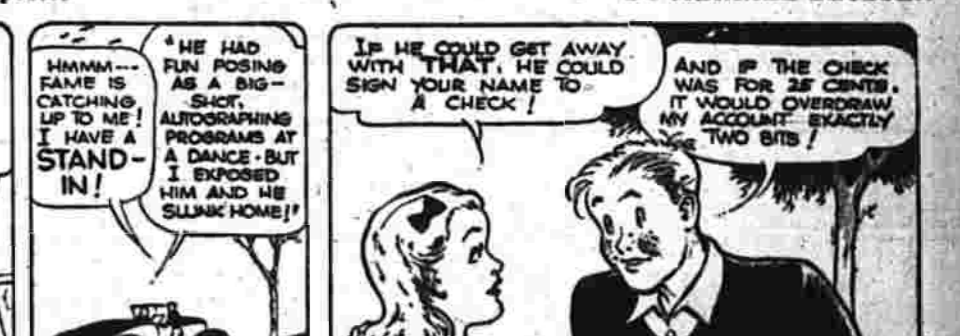
BY MERRILL BLISSNER